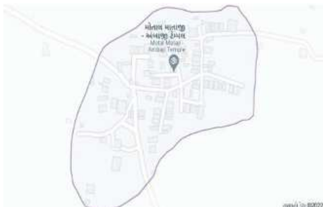
Fig MAP OF MOTAT